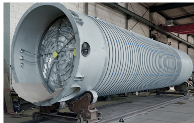
To achieve a constant medium temperature across the entire geometry, the tank bottom of the tanks will also be “heated”. The flexible hose can be easily adjusted to the curved shape of the dished head.