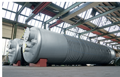
The individual storage tanks are up to 12 metres long – filled with viscous resin and hardener. And everything must be kept in a liquid, workable state.