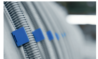
Stainless steel strips, turnbuckles and blue fast-mount clips make installation quick and easy. No welding required!